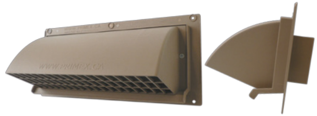
WC31068 - Brown Range Hood