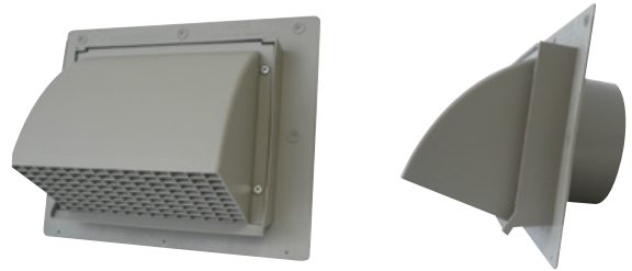
WC631 - Light Grey