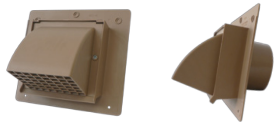
WC4 - Brown